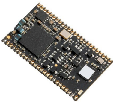
C0 version (SMT mounting)

Miniature RFID module (LF/HF/NFC) for external 50 Ohm antenna